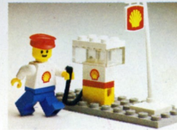
601 Petrol pump