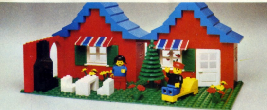
376 House with garden

There are road plates for your own street plan, cars to run on them and buildings to line the streets. Each model can be built and re-built in several ways so you can make your own town just the way you want it.