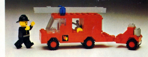
672 Fire engine