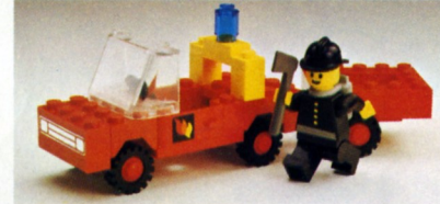
640 Fire truck and trailer