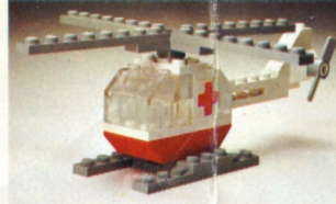
626 Red Cross helicopter