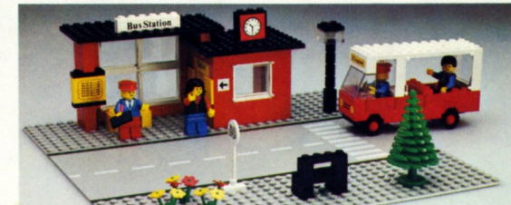
379 NEW! Bus station *