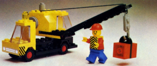
670 Mobile crane