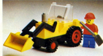
625 Tractor digger