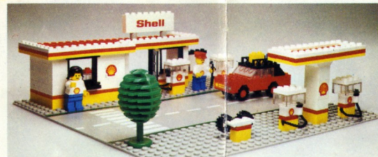
377 Service station