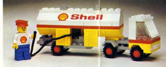
671 Petrol tanker