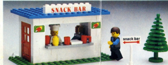
675 NEW! Snack bar *

There are road plates for your own street plan, cars to run on them and buildings to line the streets. Each model can be built and re-built in several ways so you can make your own town just the way you want it.