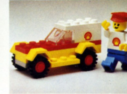
604 Shell service car