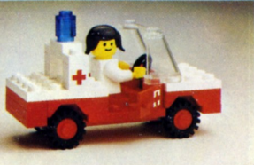
623 Red Cross car