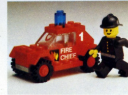
602 Fire Chiefs car