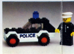
600 Police car