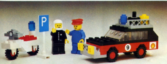
673 Rally car and police patrol