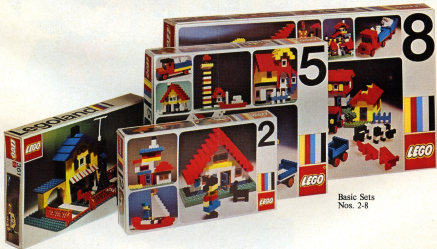
361 Tea garden cafe with baker's van

That was the time our little girl got a new Basic Set. There are seven sizes of Basic Sets. Containing everything from roofing tiles, windows and doors that can open and shut, to trees that stay green all year round. And a lot of bricks of the most useful colours and shapes. So you can build what you like. A new house for the family. Or why not a caravan?